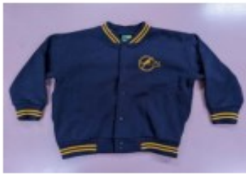
Blue Bomber Jacket