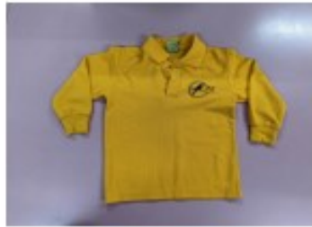
Yellow Long Sleeve Top