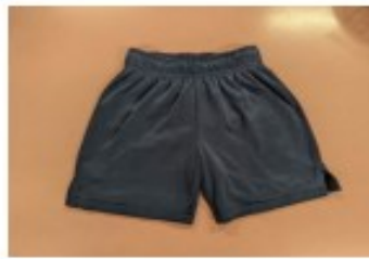
Sports Shorts - Basketball Shorts - Thinner fabric