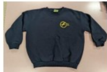
Blue Crew Neck