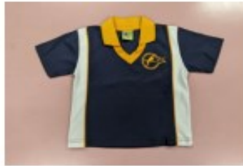
Blue Sports Top