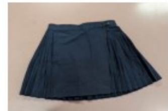
Skirt - Netball/Tennis Skirt