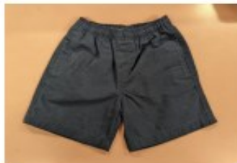
Shorts - Thicker fabric