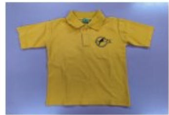
Yellow Short Sleeve Top