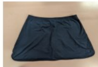
Skirt - Sports Skort