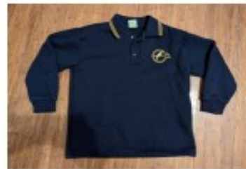
Blue Rugby Jumper