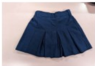
Shorts Pleated - Girls